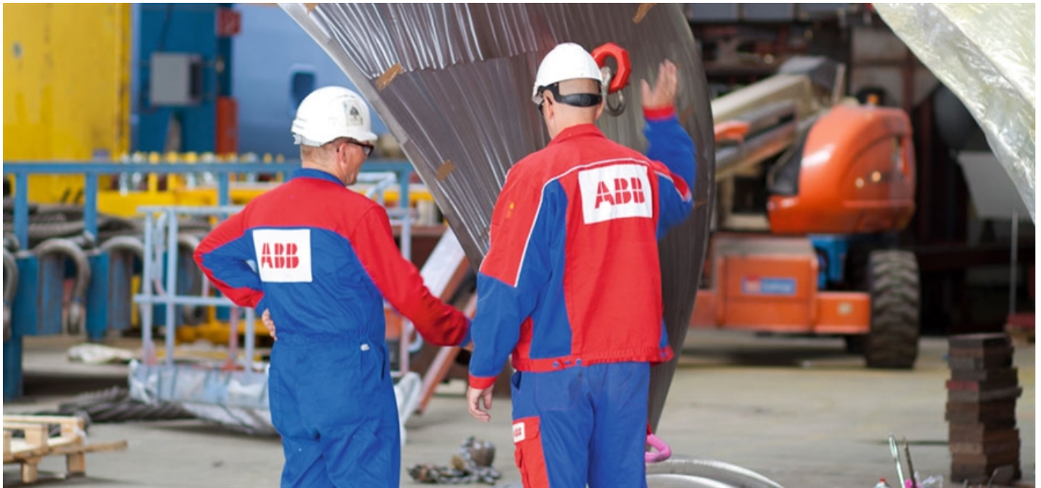
ABB's Azipods improve vessel safety, energy efficiency, manoeuvrability and performance